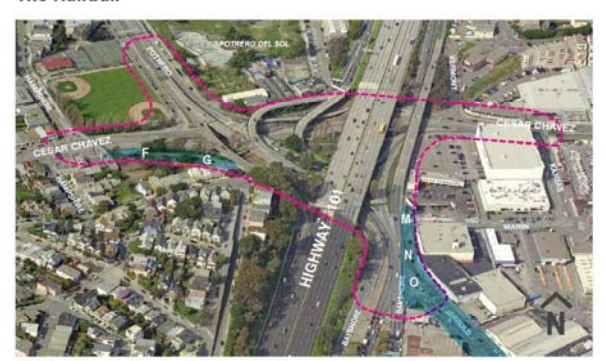
Birds-eye view of the Hairball and Key Segments