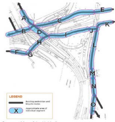
Segment Map of the Hairball